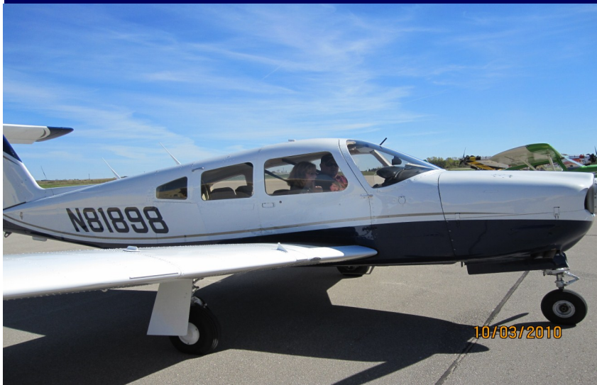
Taking an aviation “first timer” for a ride during a trip to Austin, MN