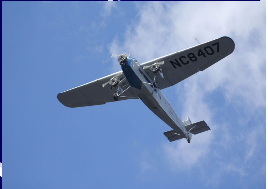
EAA's 1929 Ford Tri-Motor