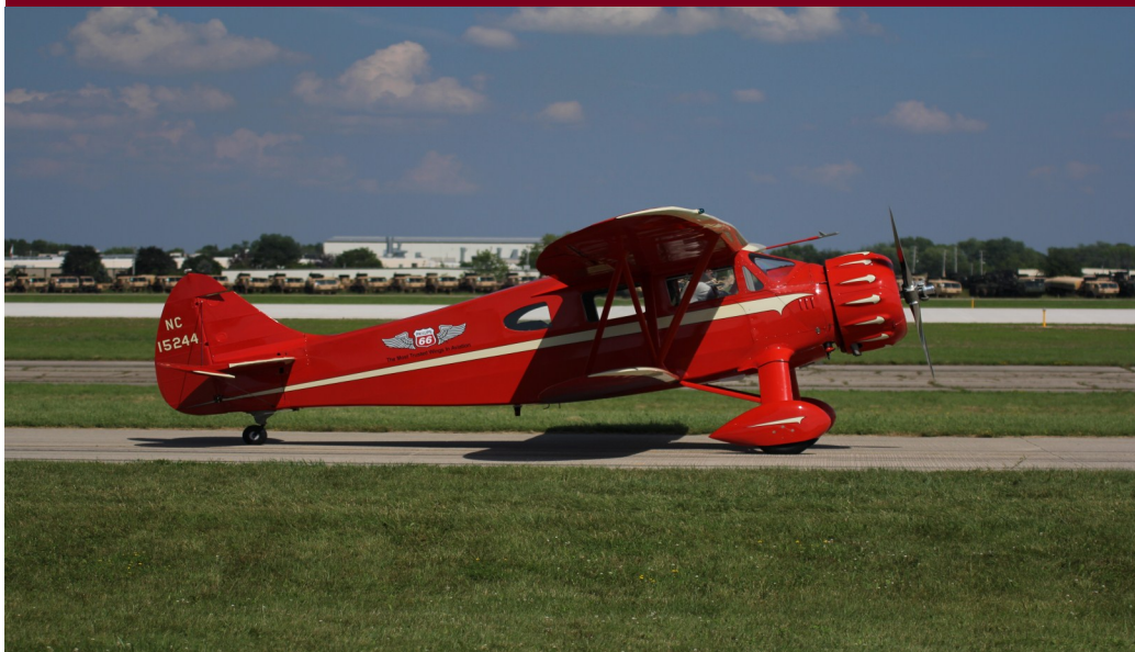
The 1935 WACO Cabin of "Miracle on the Hudson" Co-Pilot Jeff Skiles