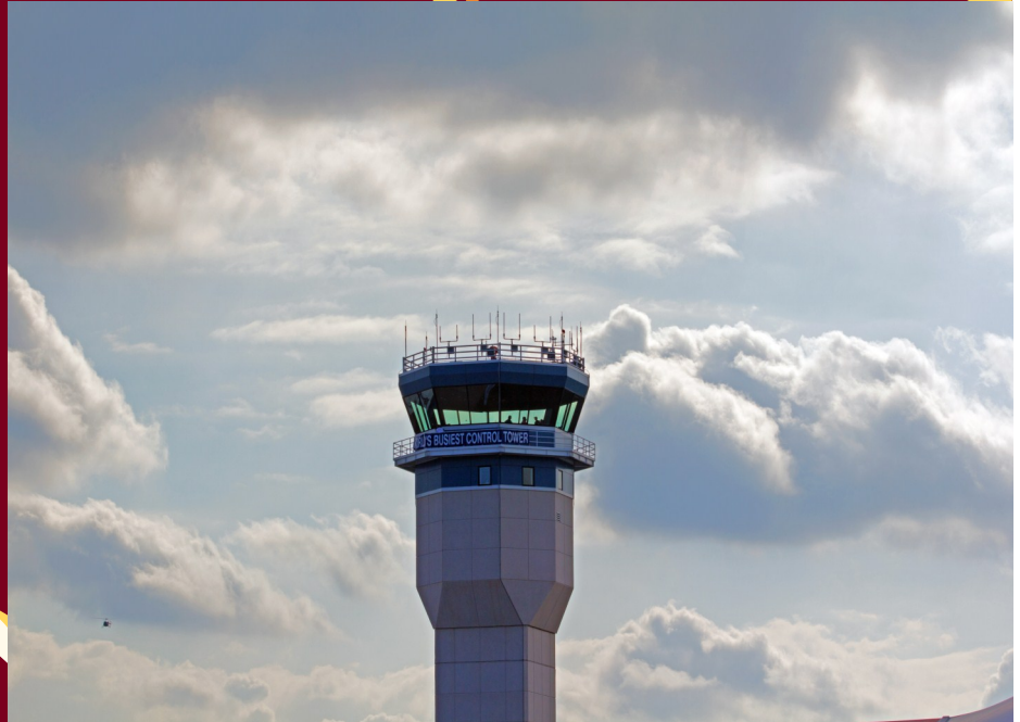
"Worlds Busiest Control Tower" KOSH