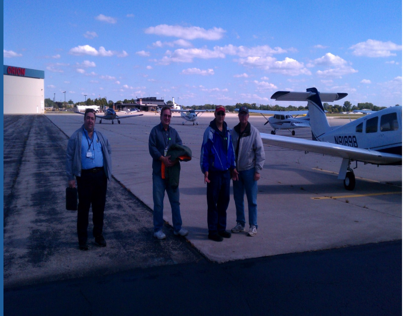
Fly out to KOSH's Pioneer Airport 9/17