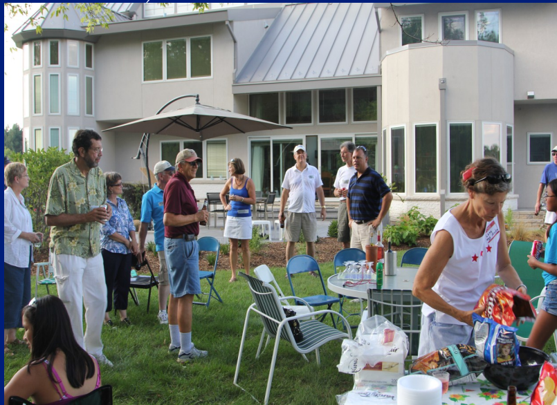
FFC BBQ August 2010